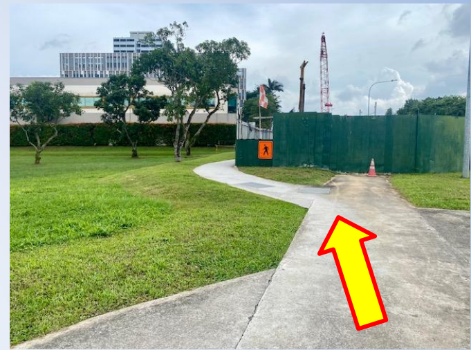
10. (Unsheltered) Continue straight along the pavement