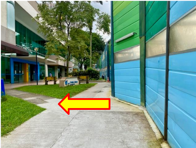
11. (Unsheltered) Turn left towards the library building