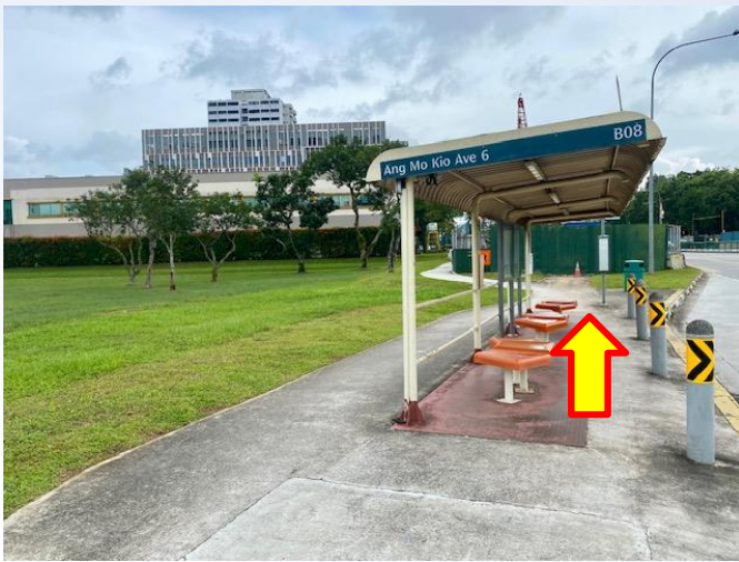
9. (Unsheltered) Turn right towards the pavement