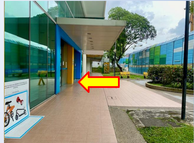
12. (Unsheltered) Turn left to enter the library