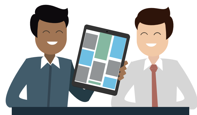
S.U.R.E. for Work