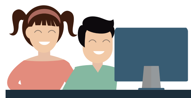
S.U.R.E. for School

S.U.R.E. for Life aims to educate the general public on the threats that deliberate online falsehoods pose to the peace and stability of society.