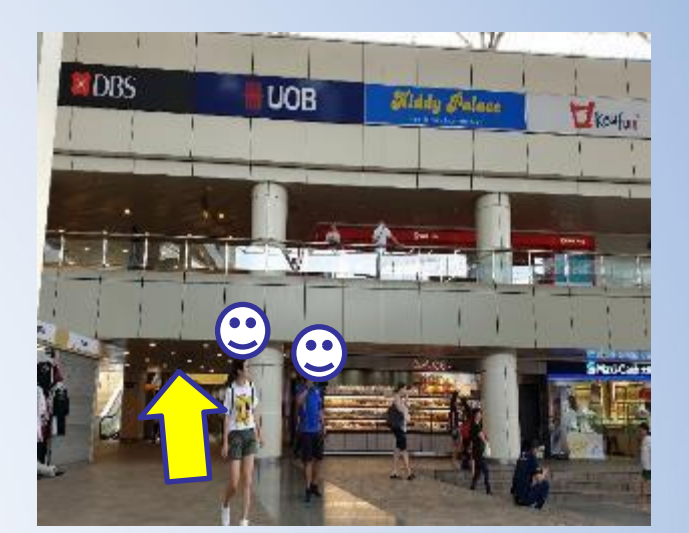
2. Exit the lift and turn left. Go straight