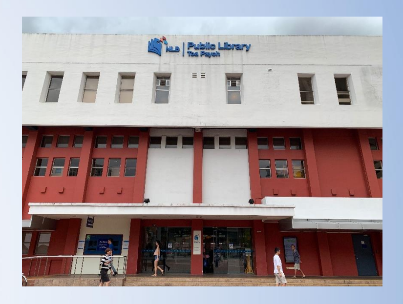
11a. Welcome to Toa Payoh Public Library!