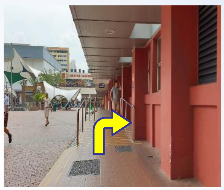
10a. Turn right. I have reached Toa Payoh Public Library