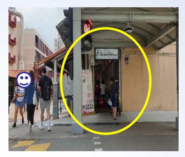
6b. For sheltered route , go right (circled in picture) and walk straight until the end of the passage