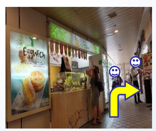
3. Go pass the shops and turn right