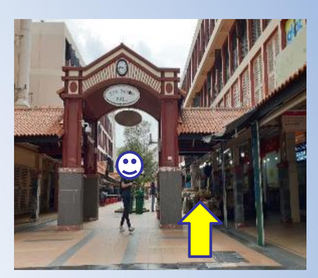
7a. Go straight pass the shops