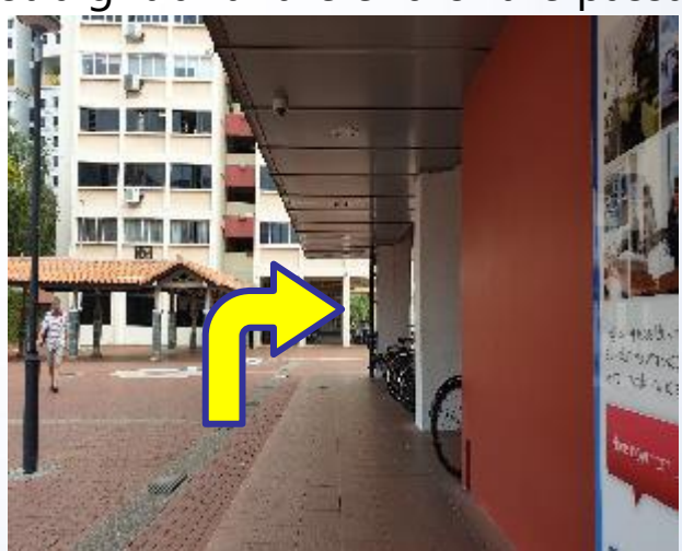
8b. Go straight and turn right. I will see Toa Payoh Public Library on my right