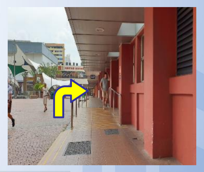
9b. Turn right. I have reached Toa Payoh Public Library!