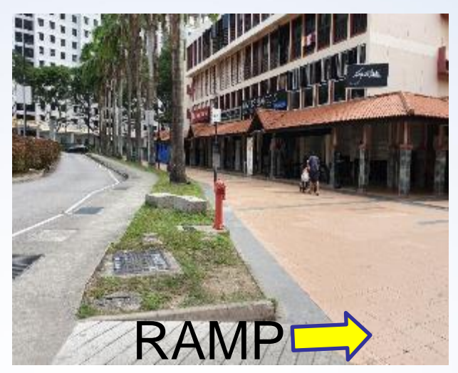
6a. For unsheltered route , go down the ramp slowly