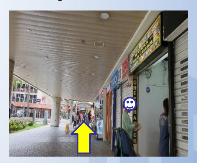
4. This is what I will see. Head towards the traffic light and cross over