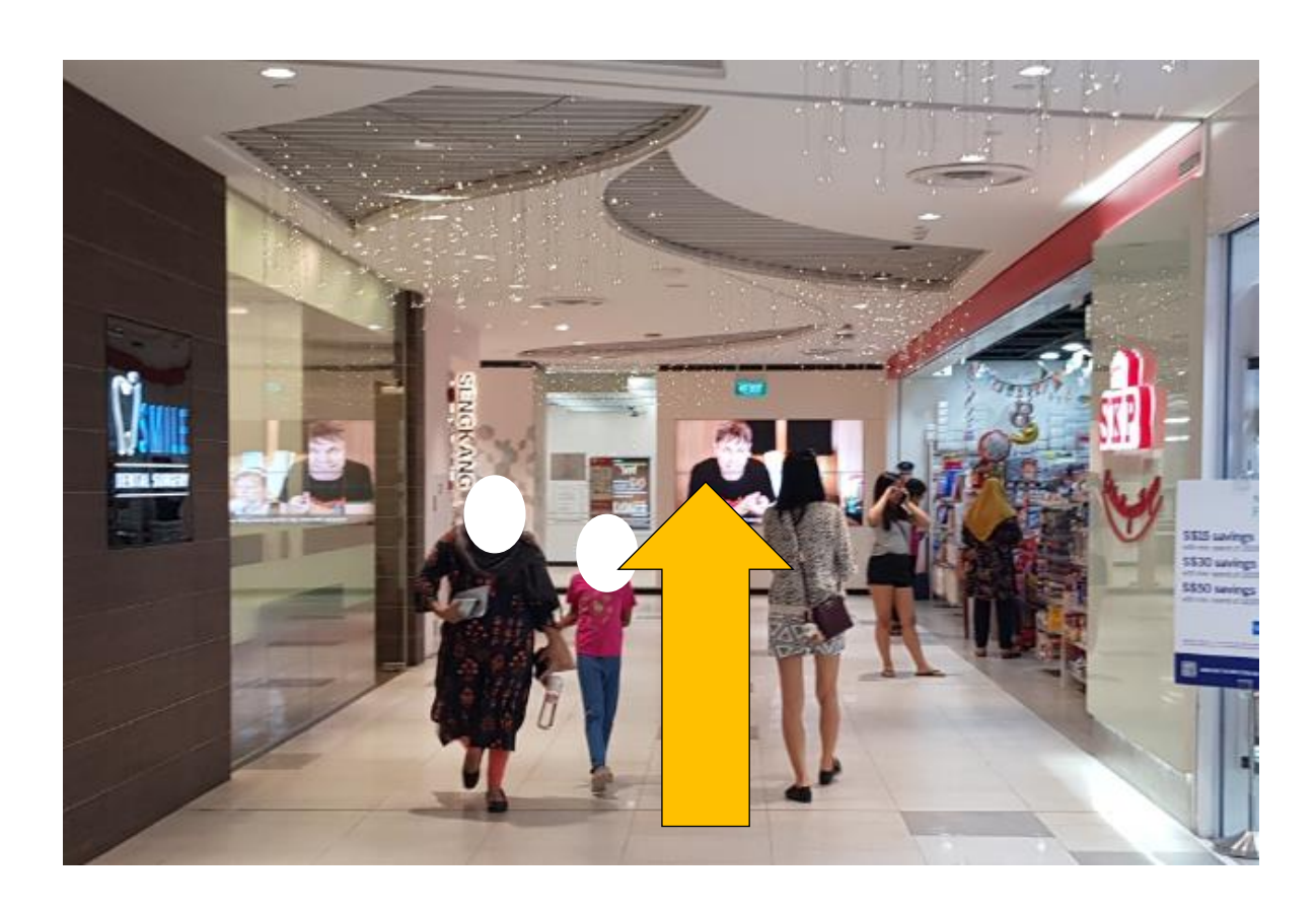
8. Continue straight and you will reach Sengkang Public Library's entrance on your left Public Library Sengkang