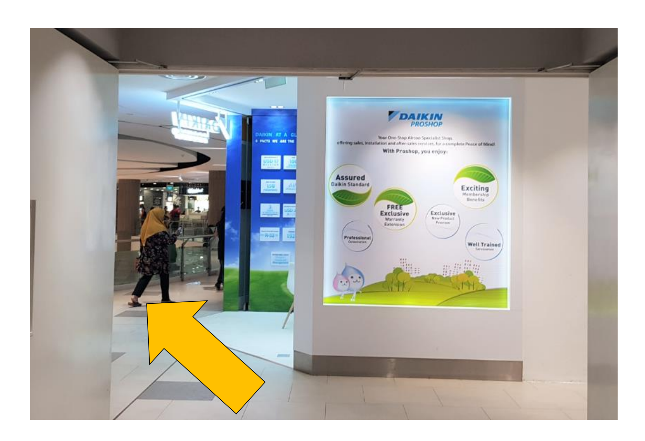
6. Exit the Lift Lobby and turn right after Daikin Proshop.