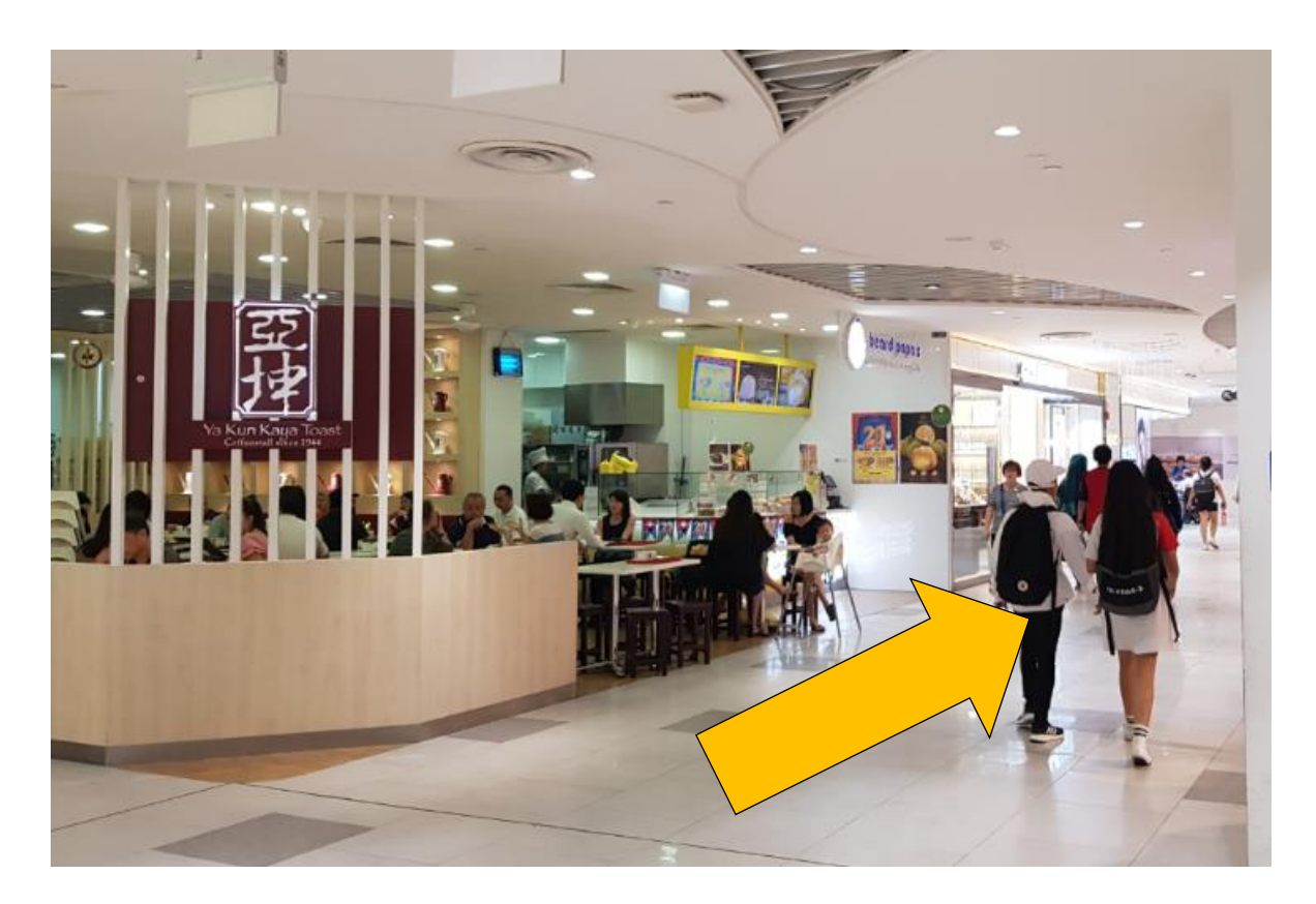
2. Turn right and take the pathway in front of Yakun Kaya Toast