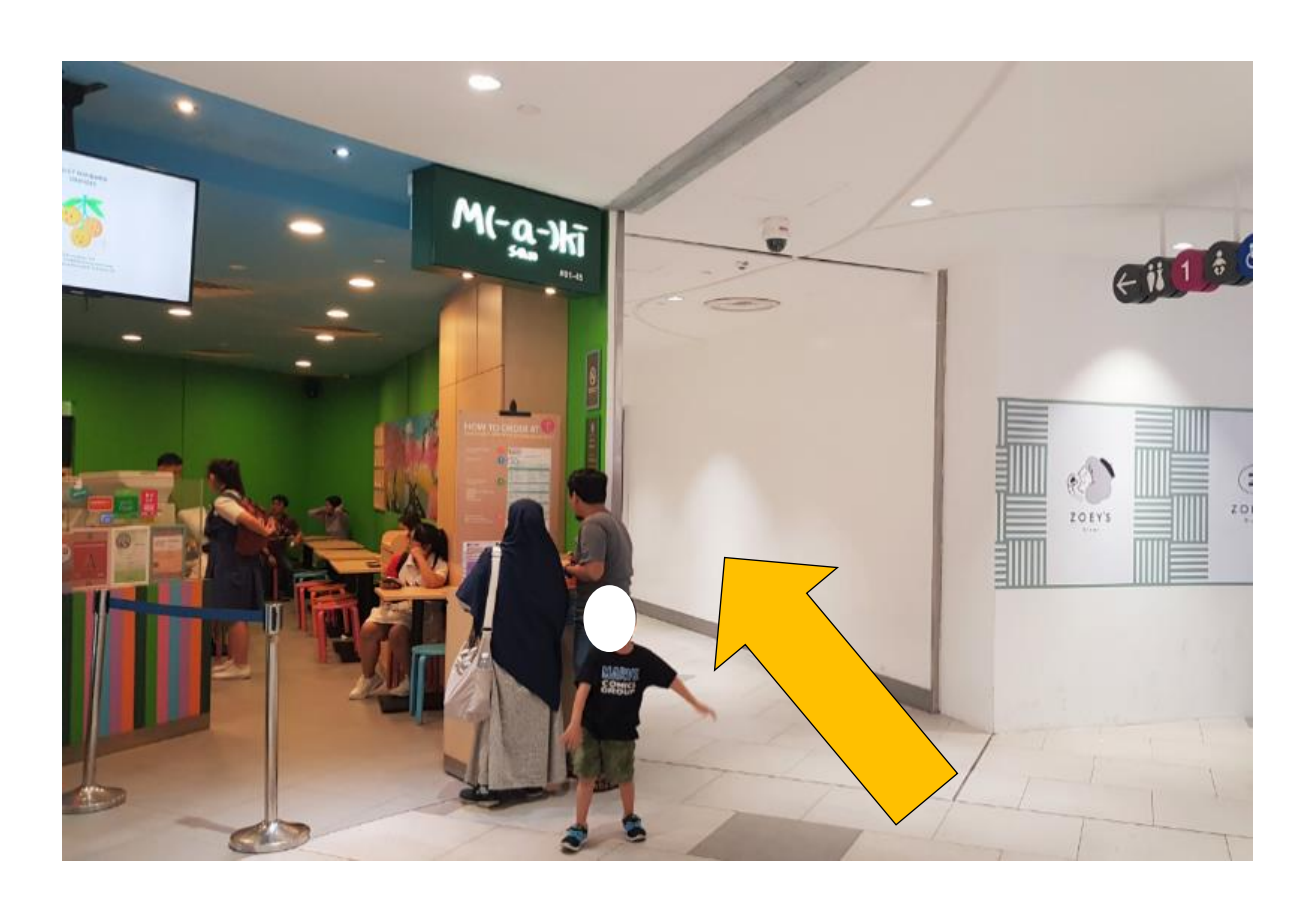
4. Turn into the pathway next to Makisan.