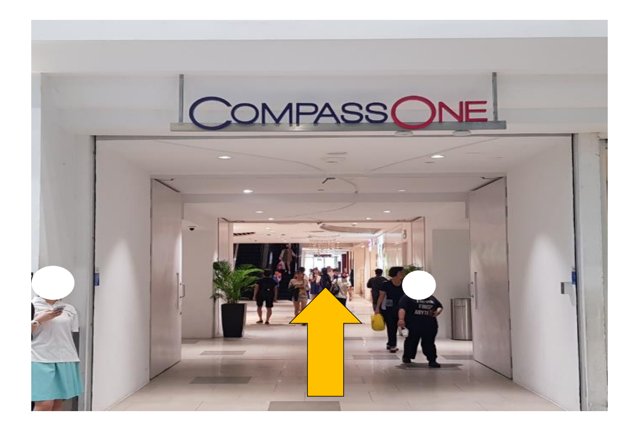
1. Take Exit B from Sengkang MRT. Go straight into Compass one.