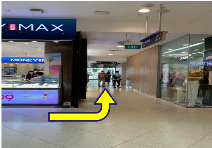
7. Turn left when I see Money Max to Passenger lift lobby