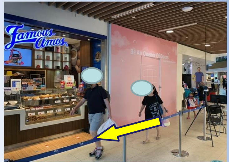
6. Go straight