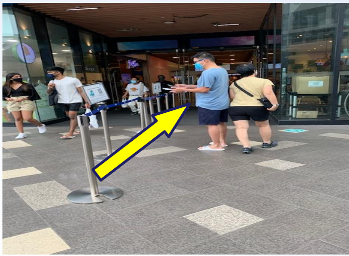
5. Join the Queue to enter the mall