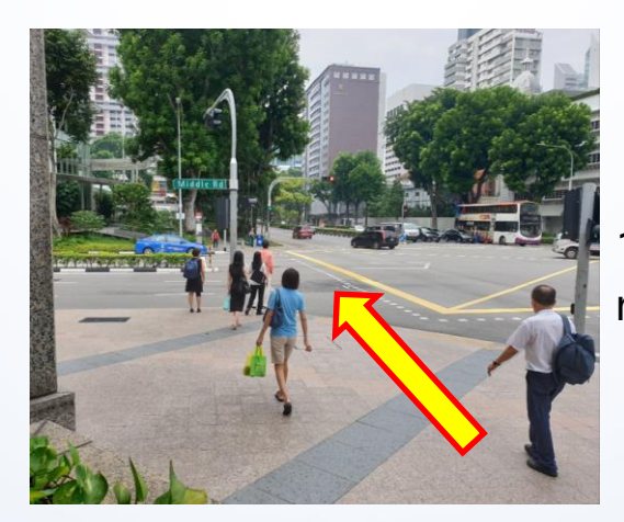
11. Cross the road