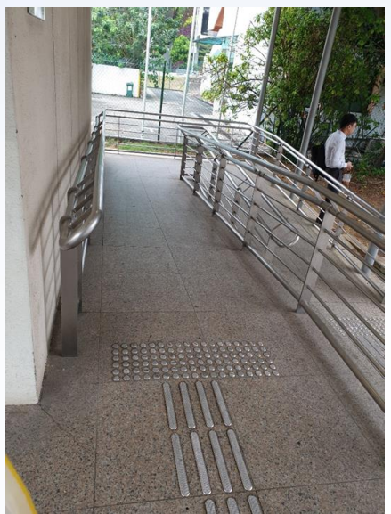
5. Once you exit the lift, turn left and you will see the ramp