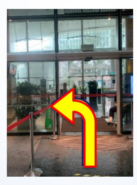
15. Turn left after entering the National Library Building

14.Head straight and turn left to enter building through an automated sliding door