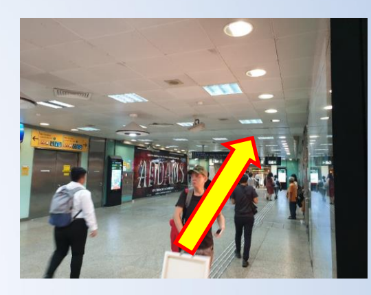
2. After right turn, go straight ahead

1. After exiting the gantry, turn right and take Exit B towards the Lift to Street