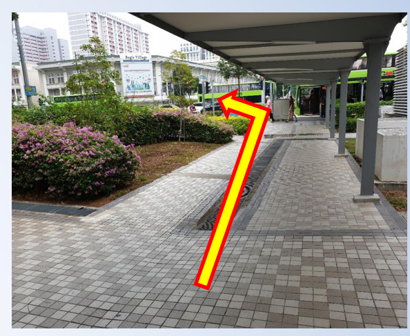
6. Go straight and turn left towards the traffic light