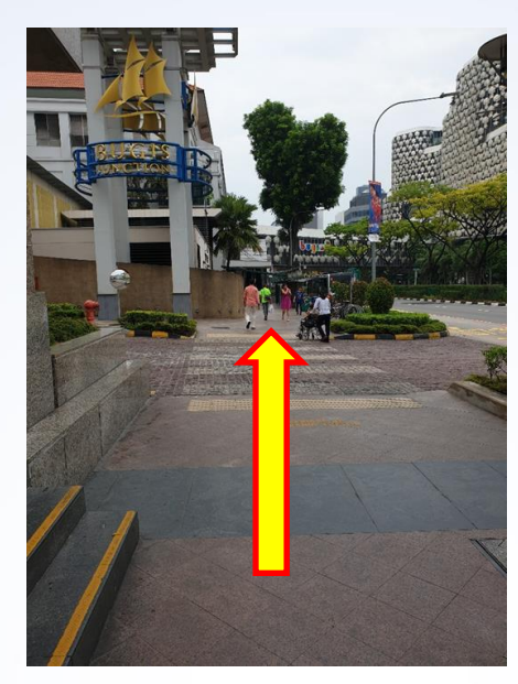
9. Keep heading Straight along Victoria Street