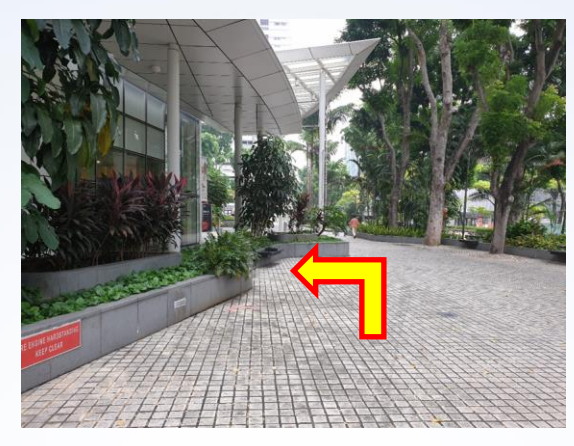
13.Head straight and turn left