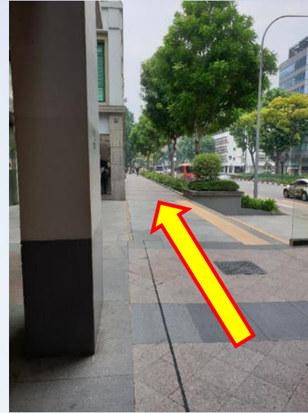
10. Head straight