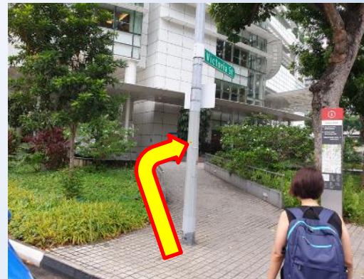
12. Head up the ramp, and turn right