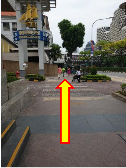
9. Keep heading Straight along Victoria Street