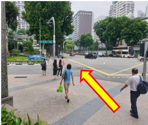
11. Cross the road