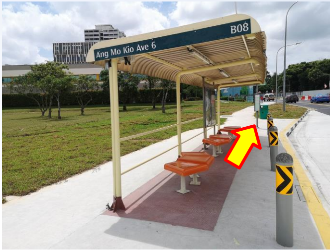
9. (Unsheltered) Turn right towards the pavement