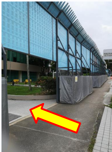
11. (Unsheltered) Turn left towards the library building