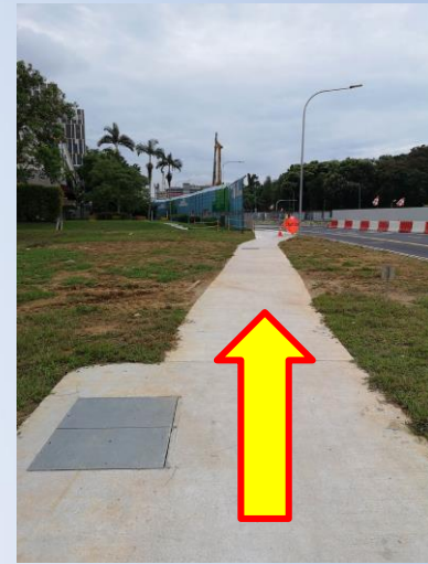
10. (Unsheltered) Continue straight along the pavement