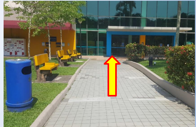
12. (Unsheltered) Go straight towards the main entrance