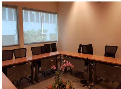
View from another angle