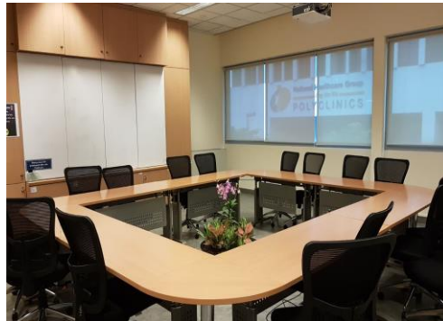
View upon entering