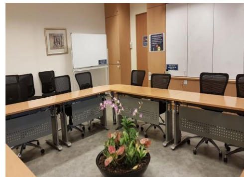
View from another angle