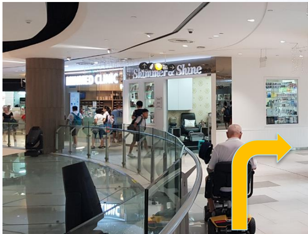
7. Go straight and turn right into the pathway before Shimmer or Shine