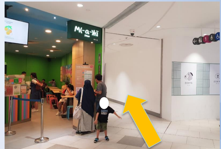
4. Go straight into the pathway next to Makisan