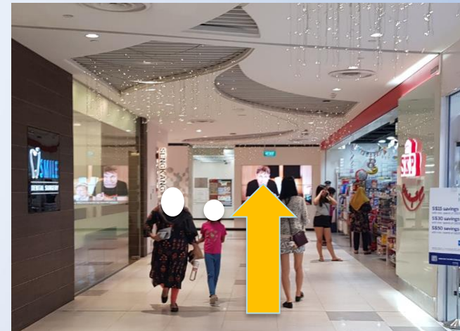
8. Go straight to Sengkang Public Library entrance