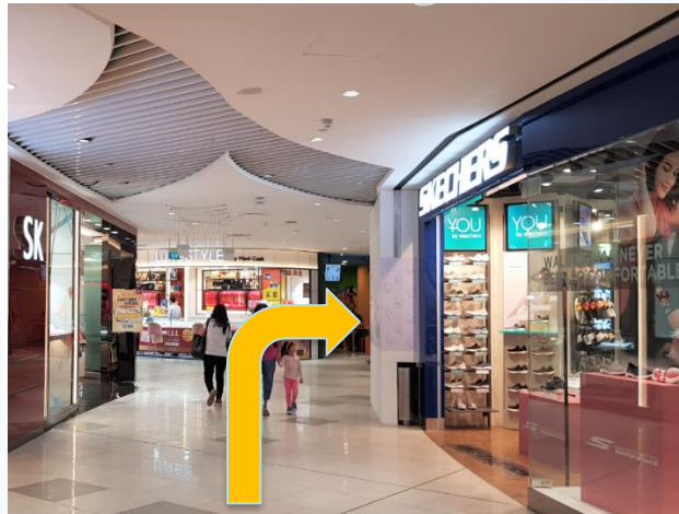
7. Go straight and turn right at Luxe Style