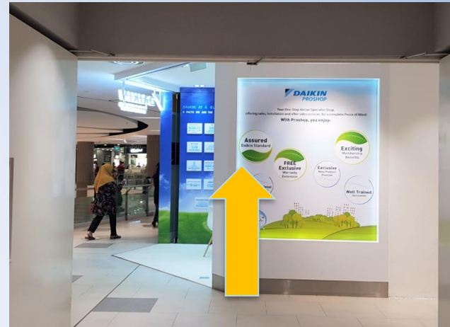
6. Make your way up using the wheelchair stair lift