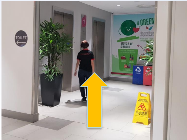
5. Make your way up to level 4 using the lift