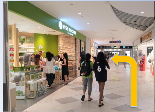
6. Go straight and turn left at iStudio